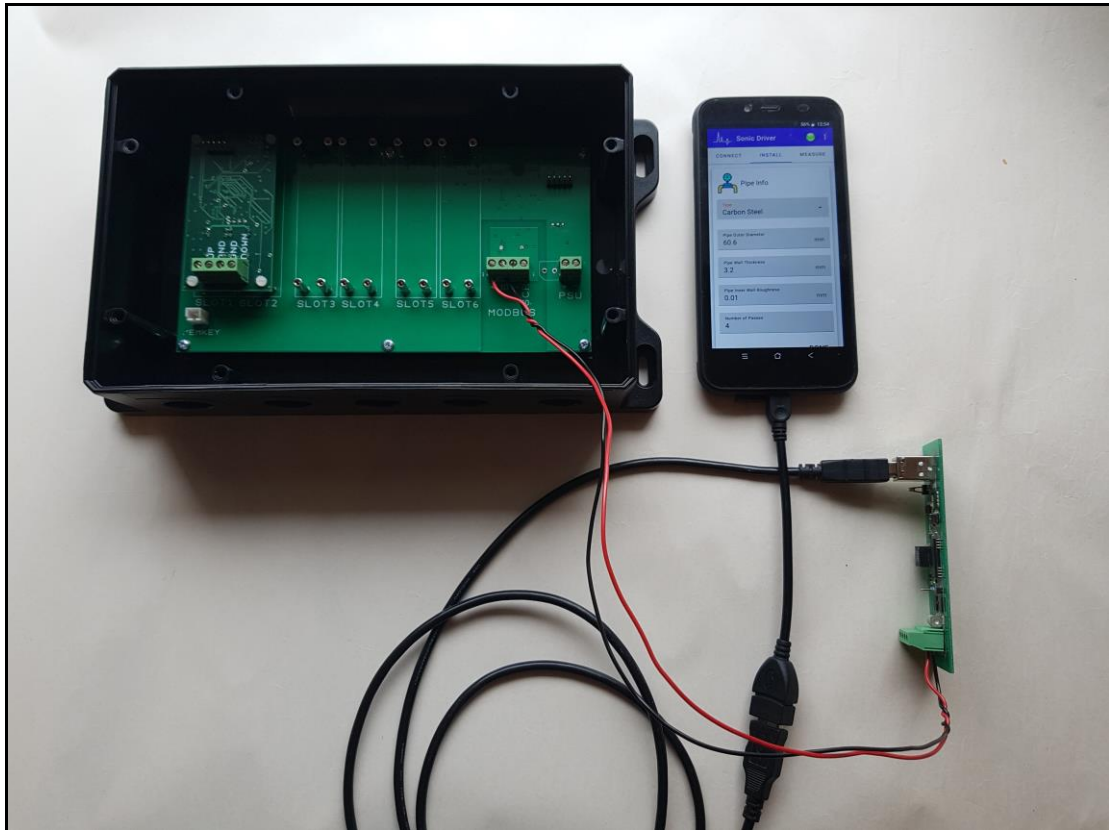
Figure (1) Mobile and PC connections

Mobile connection uses a USB-OTG cable and Modbus interface. PC connection uses a USB A/B cable and a Modbus interface, see figure (1).